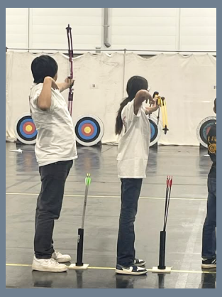
Our archery team enjoyed the NASP Archery Provincials at the Expo Center in Edmonton. Many shot personal bests!