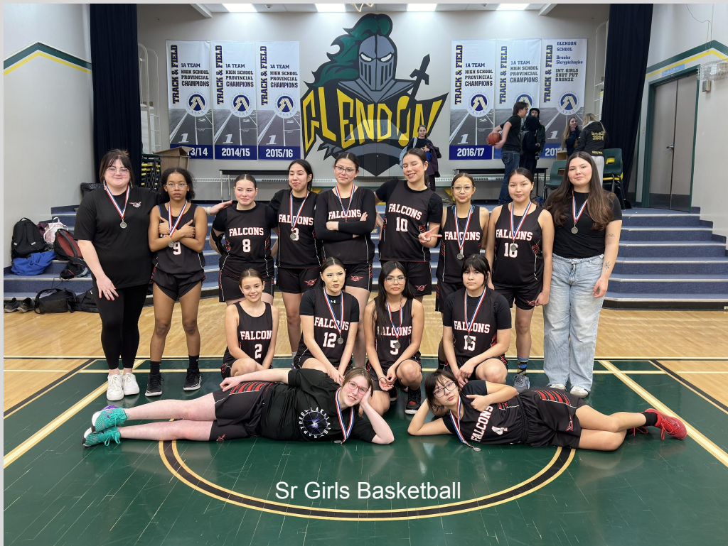
Sr Girls Basketball