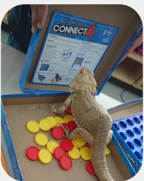
Jimmy investigating Connect 4.